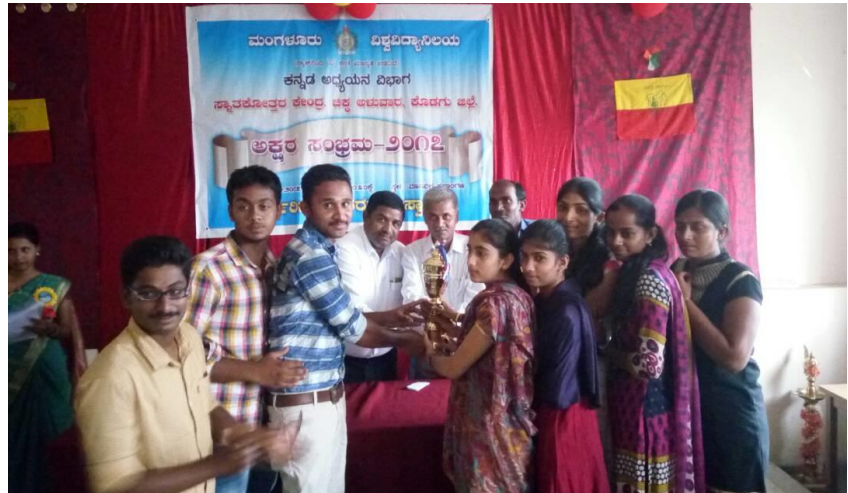
,ÀgÄPÁj ¥ÀæxÄªÄÄ zÄeÉð PÁ-ÉÁdÄ, PÄÄ±Ä@£ÄUÄgÄ vÄÄqÄPÉÍ ,ÀªÄÄUÄæ «ÄgÄUÄæÄ ¥Àæ±Ä'Ü ¥ÄjvÉÆÄµÀPÀ «vÄgÄUÉ

ªÄÄUÀ¼ÀÆgÄÄ «±Àé«zÁâð@AiÄÄ ªÄi:ÜAiÄÄ°è£À ¥ÀzÀ« PÁ-ÉÁf£À LaÒPÀ PÀ£ÀßqÀ «zÁÿðUÀ¼À£ÄÄß D°Áéµ¹, CªÄjUÉ D±ÄÄ`sÁµÄt ,ÀzszÉð, PÀ£ÀßqÀ gÀ,À¥Àæ±Éß, `sÁªAVÄVÉ ,ÀzszÉð, PÀª£À,ÀzszÉð, ZAZÁð ,ÀzszÉðAiÄÄ£ÄÄß °À«ÄäPÉÆ¼ÄÄ ÁVvÄÄÜ. ,ÄÄ. 80 «zÁÿðUÀ¼ÄÄ ««zsÀ PÁ-ÉÁdÄUÀ½AzÀ DUÀ«Ä'zÄÝgÄÄ. ¢£À«r £ÄqÉzÀ ««zsÀ ,ÀzszÉðUÀ¼ÄÄ°è «eÉÄvÀgÄzÀªÄjUÉ ¥Àæ±Ä'Ü ¥ÄvÄæ, ¥ÄjvÉÆÄµÀPÀª£ÄÄß PÉÆqÄ-Á-ÄvÄÄ. ,ÀªÄÄUÄæ «ÄgÄUÄæÄ ¥Àæ±Ä'ÜAiÄÄÄ ,ÀgÄPÁj ¥ÀæxÄªÄÄ zÄeÉð PÁ-ÉÁdÄ, PÄÄ±Ä@£ÄUÄgÄ CªÄjUÉ zÉÆgÄQvÄÄ.