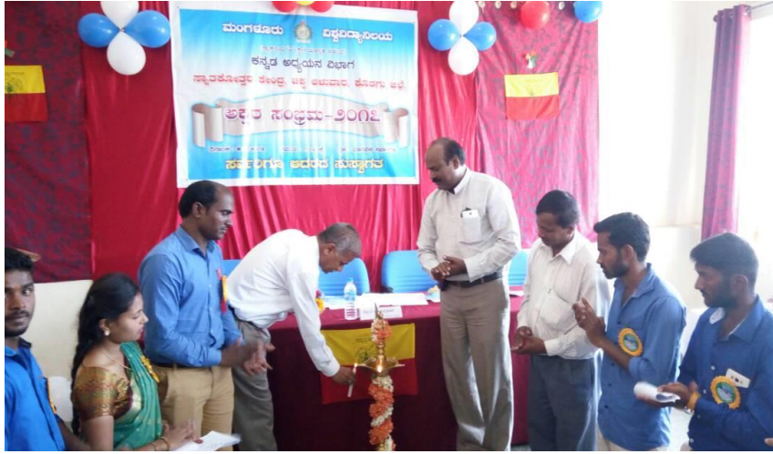
CPÀëgÀ ,ÀA`sÀæ`ÀÄ-2017 GzÁÍ£É

ªÄÄUÀ¼ÀÆgÄÄ «±Àé«zÁâð@AiÄÄ ªÄi:ÜAiÄÄ°è£À ¥ÀzÀ« PÁ-ÉÁf£À LaÒPÀ PÀ£ÀßqÀ «zÁÿðUÀ¼À£ÄÄß D°Áéµ¹, CªÄjUÉ D±ÄÄ`sÁµÄt ,ÀzszÉð, PÀ£ÀßqÀ gÀ,À¥Àæ±Éß, `sÁªAVÄVÉ ,ÀzszÉð, PÀª£À,ÀzszÉð, ZAZÁð ,ÀzszÉðAiÄÄ£ÄÄß °À«ÄäPÉÆ¼ÄÄ ÁVvÄÄÜ. ,ÄÄ. 80 «zÁÿðUÀ¼ÄÄ ««zsÀ PÁ-ÉÁdÄUÀ½AzÀ DUÀ«Ä'zÄÝgÄÄ. ¢£À«r £ÄqÉzÀ ««zsÀ ,ÀzszÉðUÀ¼ÄÄ°è «eÉÄvÀgÄzÀªÄjUÉ ¥Àæ±Ä'Ü ¥ÄvÄæ, ¥ÄjvÉÆÄµÀPÀª£ÄÄß PÉÆqÄ-Á-ÄvÄÄ. ,ÀªÄÄUÄæ «ÄgÄUÄæÄ ¥Àæ±Ä'ÜAiÄÄÄ ,ÀgÄPÁj ¥ÀæxÄªÄÄ zÄeÉð PÁ-ÉÁdÄ, PÄÄ±Ä@£ÄUÄgÄ CªÄjUÉ zÉÆgÄQvÄÄ.