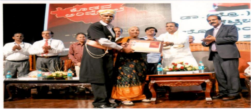
Honourable Chief Minister Sri Siddaramaiah honouring the writers with Mementoes

Activities of Prasaraᅡga from January 2017 to June 2017.