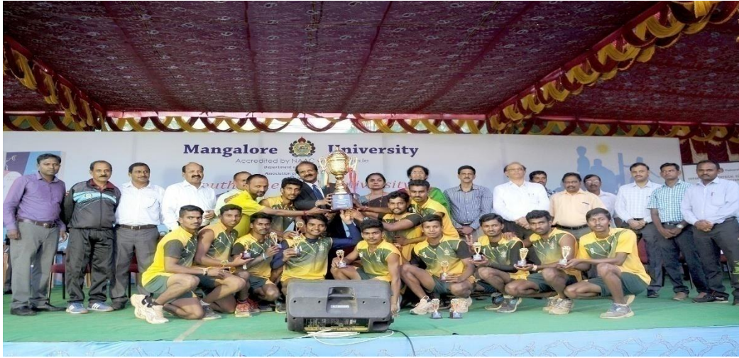
Mangalore University Kho-Kho Men's Team secured First Place in South Zone Inter University Kho-Kho Competition held at Mangalore University, Mangalagangothri from 10 to 13 January, 2017 and qualified for All India Inter University Competitions.