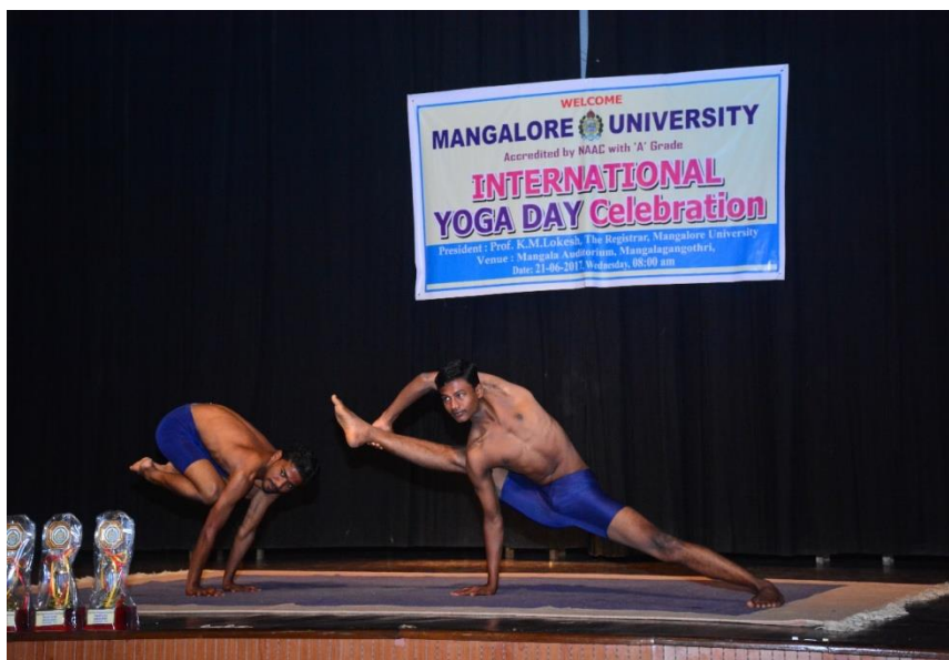
Advanced Yogasana Demo by the students of the Department of Human Consciousness and Yogic Sciences, Mangalore University.