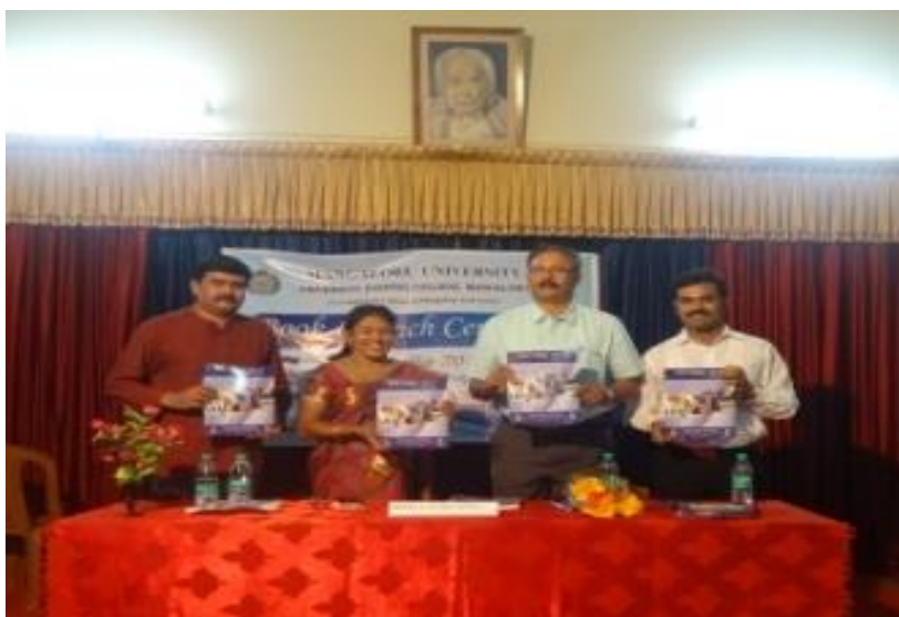
Release of an edited book on GST