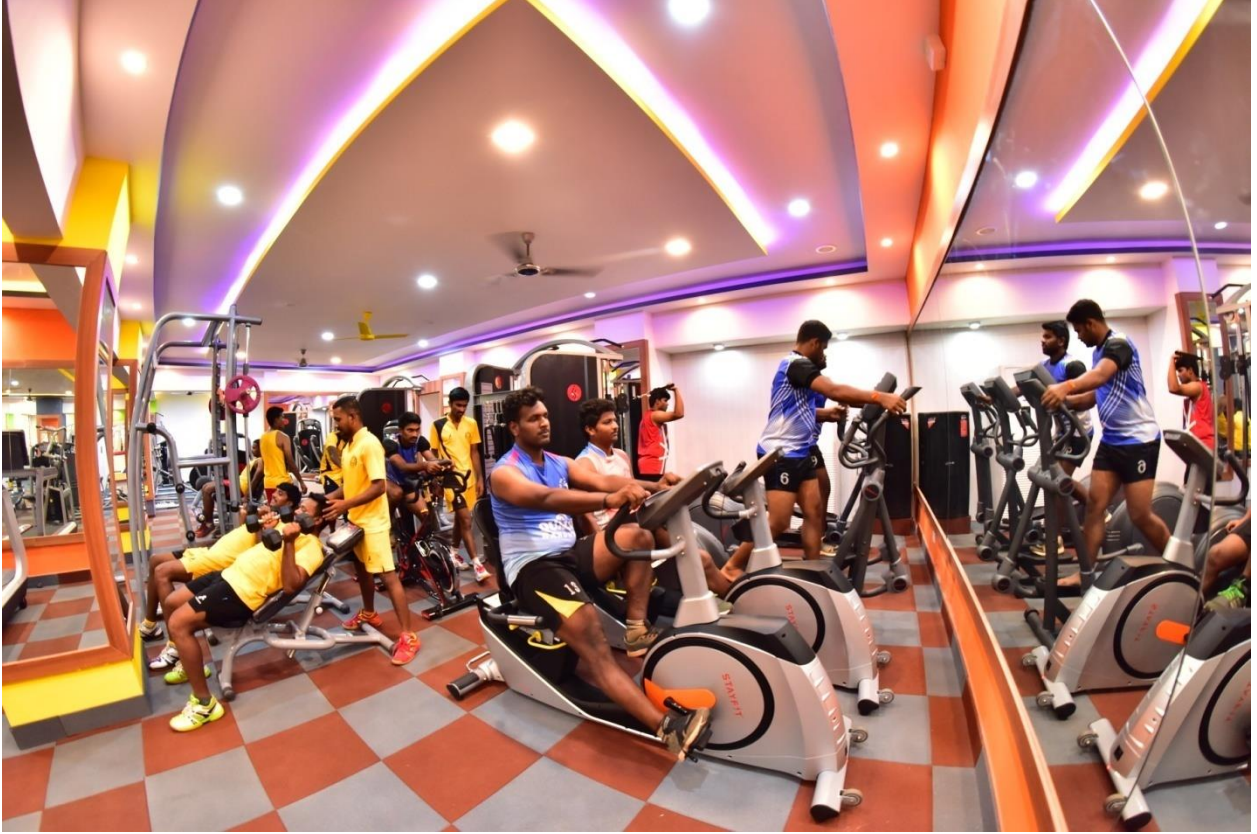
Students absorbed in gym activity at Indoor Stadium, Mangalore University