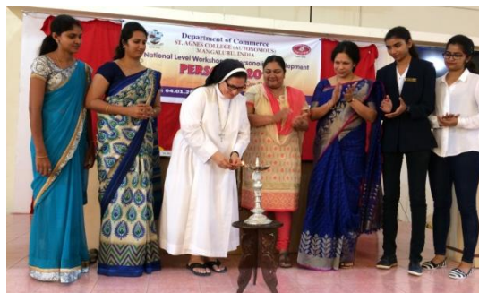
Inauguration of PERSONA