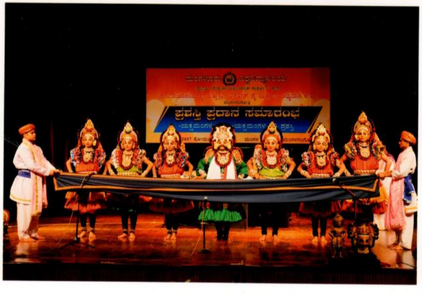
The students' Yakshamangala Troupe performing Yakshagana, Panchajanya .

Yakshamangala Book Award for his outstanding Research Work Yakshagana Kavi-Kavya Vihaara .