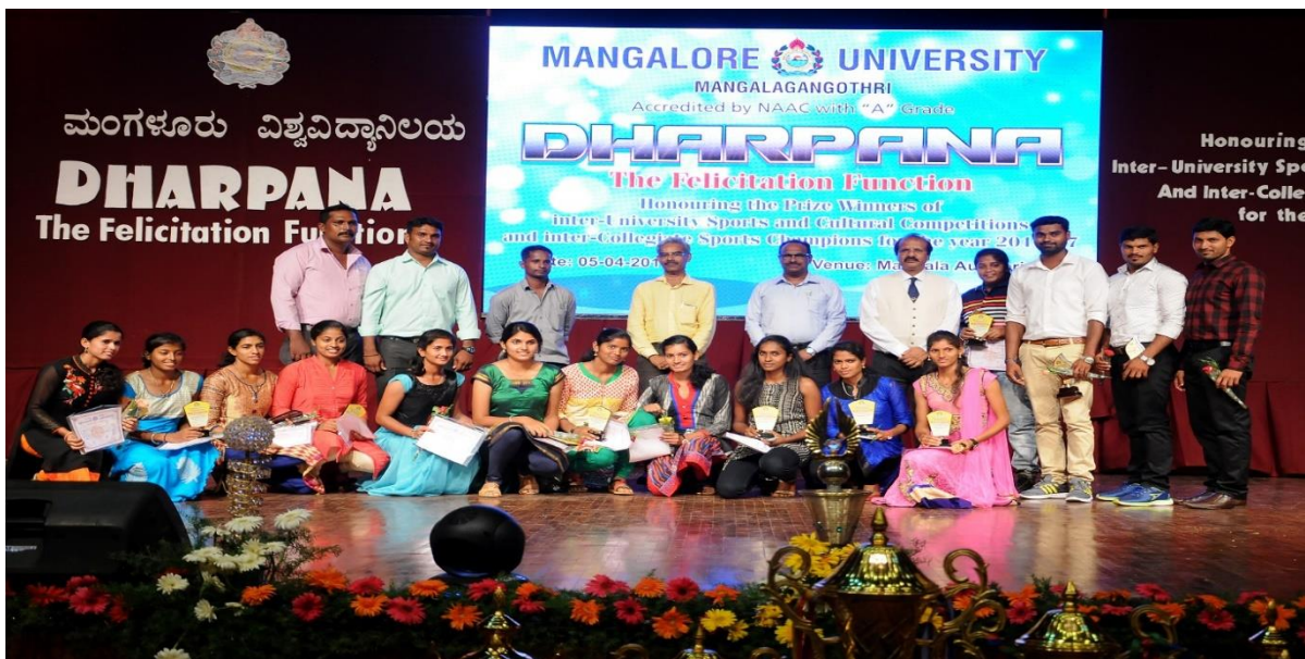
Mangalore University Netball Women's Team secured fourth Place in All India Inter University Netball competition held at SRTM University Nanded, from 6 to 10 March, 2017.