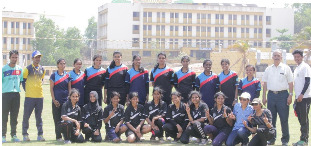
Finalists of First Intercollegiate Speech and Hearing Throwball Tournament (Blue Jersey: Dr. M V Shetty Institute of Speech & Hearing; Black Jersey: Nitte Institute of Speech & Hearing)