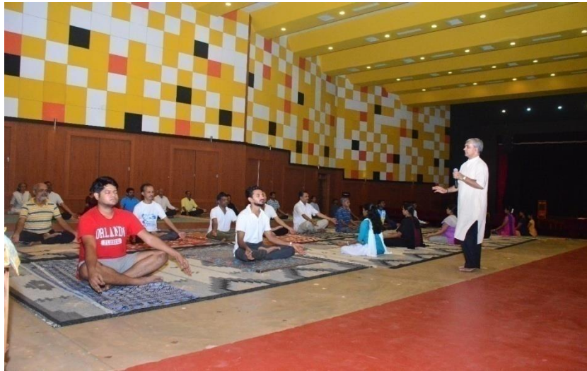
Yoga practicing session

Jawahar Navodaya Vidyalaya Mudipu, Vishwamangala Institutions, Konaje, Govt. First Grade College, Uppinangadi, Gokarnanatheshwara College, Mangalore & Institute of Chartered Accountants of India, Mangalore. 1750 participated in the programme.